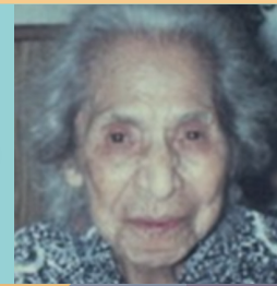
Great, Great Grandmother 106 Years